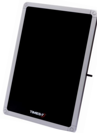
The SlimLine A6032